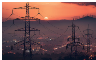
Electric Routine Inspection